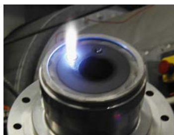
Figure 1. Plasma Igniter in operation.

11-12]. Among perspective solutions are radiofrequency (RF) and microwave (MW) discharges, as far as non-thermal torches with a fuel feeding into the arc chamber. Recently developed by