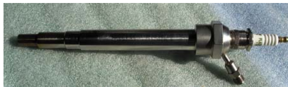
Figure 2. Supersonic Plasma Igniter.

Applied Plasma Technologies (APT) supersonic torch based on transient glow to spark discharge is shown in Fig.2 [9].