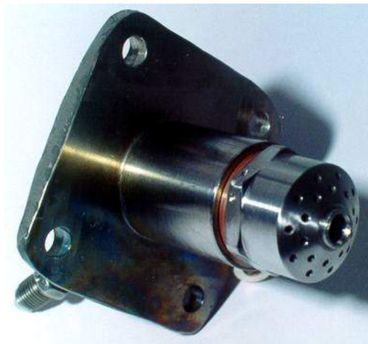
Figure 4. Plasma fuel nozzle for gaseous fuels appearance.

Plasma fuel nozzle as a combination of plasma generator and fuel atomizer with simultaneous fuel atomizing, ignition and flame control in one unit is the most complicated and advanced plasma assisted combustion solution. Several experimental nozzles for gaseous and liquid fuels with a flexi-fuel operation and steam feeding are under development in APT. The main advantages of these nozzles are: (a) dramatically increased ignition reliability, (b) much wider equivalence ratio or lambda range, (c) significant decrease in T_4 (RIT) jump at the point of fuel ignition, (d) utilization as a pilot burner, (e) utilization for hydrogen enriched gas generation, (f) reduction of a combustion zone geometry, (g) reduction of the combustion chamber walls temperature, (h) increase of a combustion efficiency (COP), (i) achieving smokeless operation, (j) simultaneous burning of several fuels, (k) smooth regulation in a wider turn down ratio. One of a plasma nozzle samples for gaseous fuel burning in a gas turbine is provided in Fig.4.